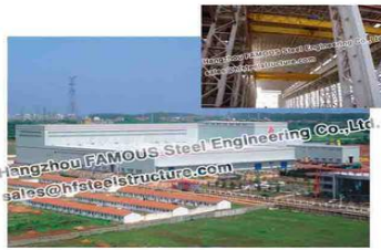
AREVA Transformer Factory Project Covering an area totaled 33,842 sq.m, consumed steel in 4299.5 tons

Was generally contracted by FLUOR CO., LTD., the total steel consumption volume for Phase I project reached over 30,000 tons and this program was in a high-rise steel structure of 4-7 floors.