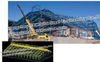
CHILE Piping-truss Project 90m Single-span Workshop