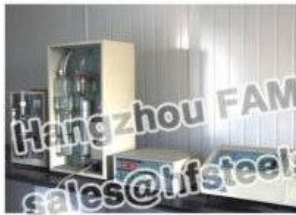
元素分析仪 Elemental analyzer