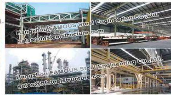
LDK Polysilicon Public Project Generally contracted by FLUOR CO., LTD.