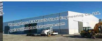
NEW ZEALAND Barns / Grain Warehouses Normal structural steel warehouses or light gauge steel structure with cold bended profiles