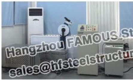
ZBC-300B液晶摆锤冲击机 ZBC-300B LC pendulum clock impactor

Our group has established an advanced physical and chemical testing center of steel structure, owns the testing equipment such as electronic universal testing machine, electro-hydraulic servo universal testing machine, elemental analyzer, torsional testing machine, impact testing machine, ultrasonic flaw detector, blue ink coating thickness gauge, liquid crystal pendulum clock impactor, etc. In a large number of engineering practices, the company organized a high-quality construction team who grasp the leading construction technology, found scientific and strict construction management control process, has a control of the whole construction process to ensure the project quality.