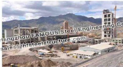
BOLIVIA Cement Plant 3,655.72 tons in the first phase 7,200 tons in the second phase