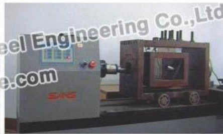
CTT-1000扭转试验机 CTT-1000 torsional testing machine