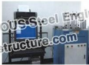
ZWK-4维卡热变形 ZWK-4 Vicat thermal distortion