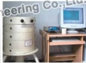
FTFC-2002全自动建材放射检测仪 FTFC-2002 all-automatic radiation meter of building materials