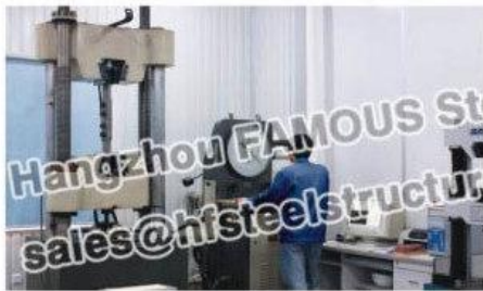
CTM5504电子万能试验机 CTM5504 electronic universal tester