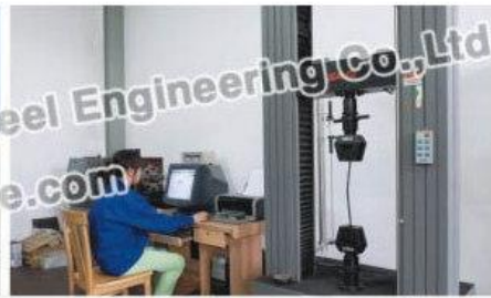
SHT4106电液伺服万能试验机 SHT4106 electro-hydraulic servo universal tester